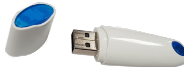
NEW BLUETOOTH DONGLE