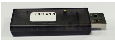
OLD RF DONGLE

The new BrightLogic Bluetooth USB dongle allows easy communication between the PC/laptop and the Bluetooth enabled BrightLogic laundry dosing system. The new BrightLogic Bluetooth dongle is not backwards compatible; the older style BrightLogic RF dongle is still needed for pre-December 2018 BrightLogic laundry dosing systems in the field. It is easy to identify BrightLogic laundry dosing units with the upgraded Bluetooth enabled system, they have a Bluetooth symbol above the LCD screen. This Bluetooth technology is specific to the BrightLogic laundry dosing system, the generic Bluetooth found in most PCs/laptops will be unable to pair with the BrightLogic laundry dosing system.